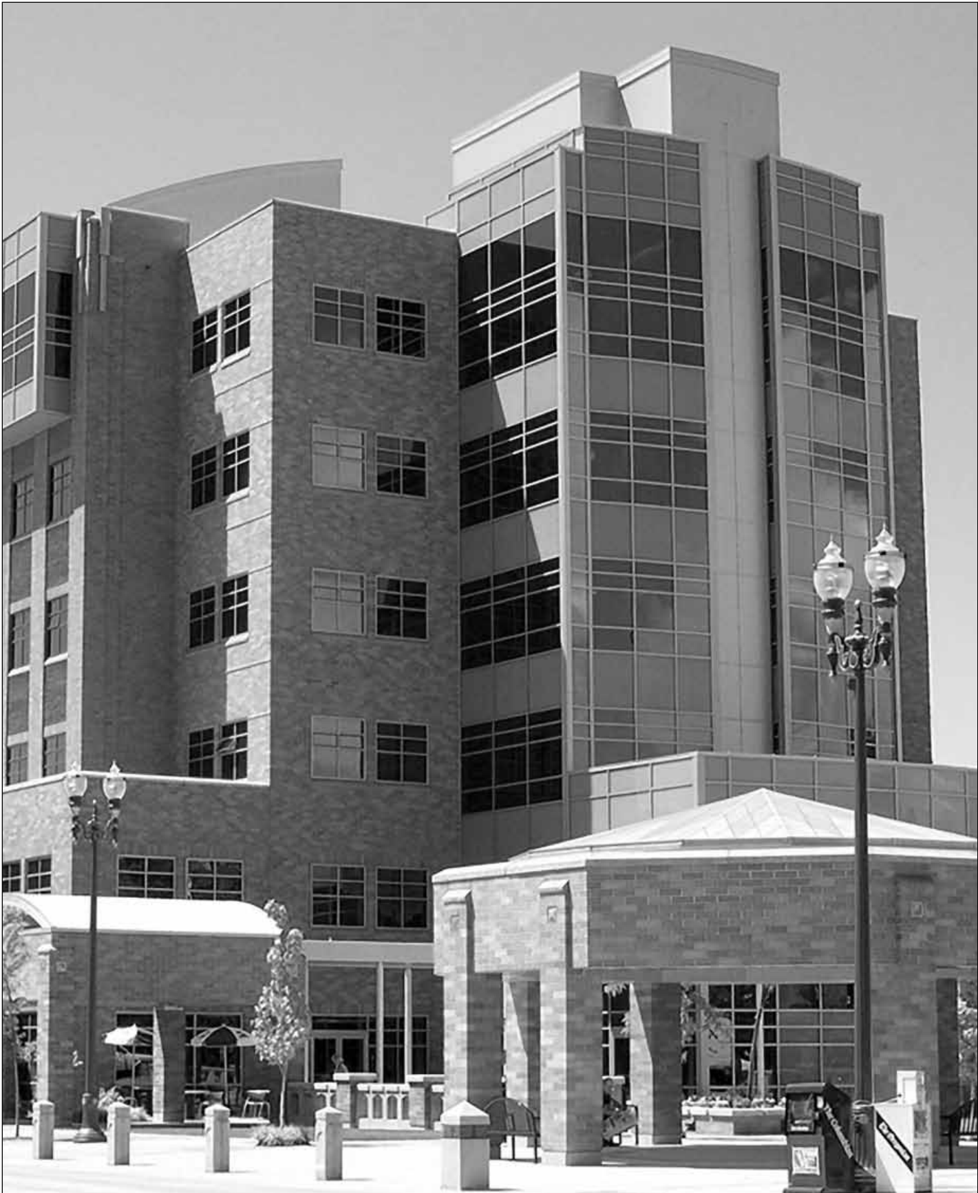
Clark County Public Service Center at 1300 Franklin Street, Vancouver. One-stop shopping for many county services: marriage licenses, property tax payments, permits, GIS maps, human resources, solid waste and recycling, neighborhood associations and much more.