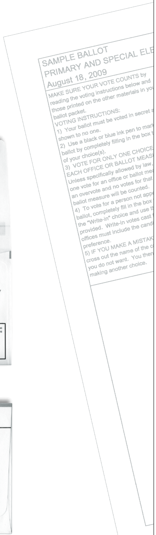
(a) Glue strips

If you need help, call the Elections Office at (360) 397-2345.