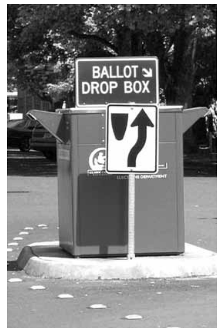
Ballot drop box on W 14 th and Esther streets, Vancouver.

Yacolt Primary School 406 W Yacolt Road, Yacolt