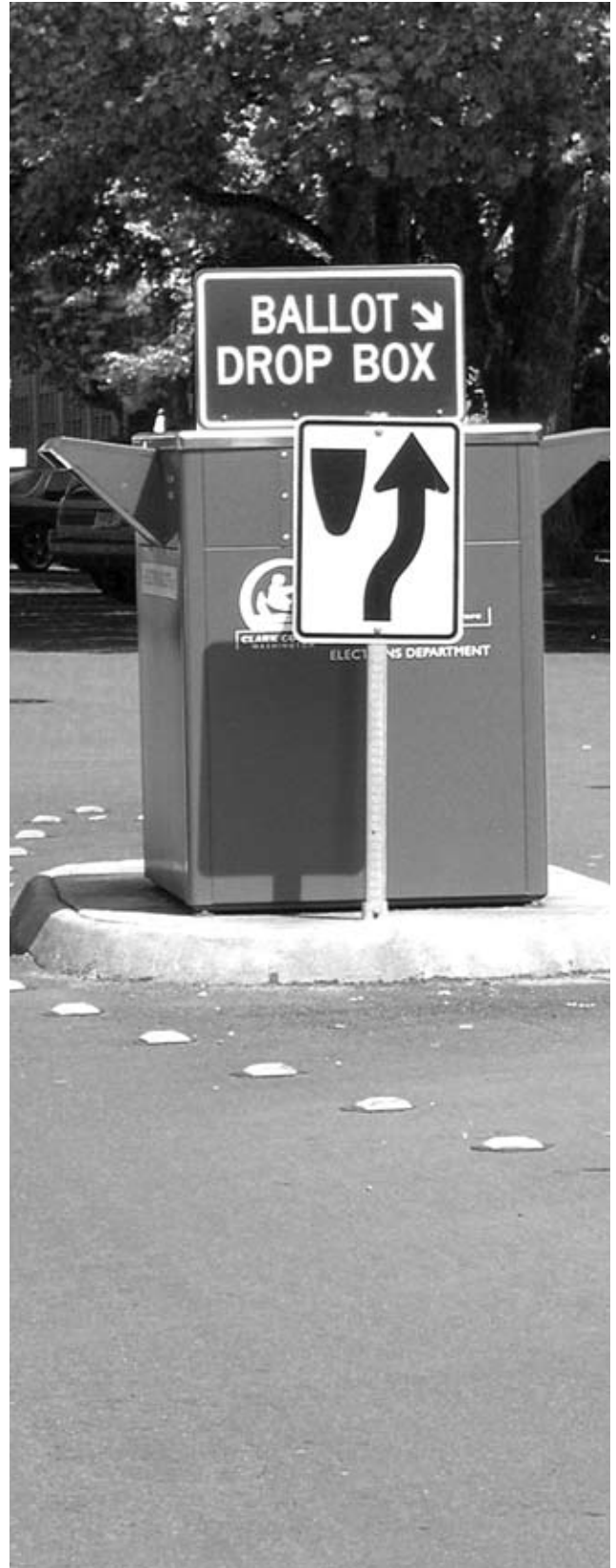
Ballot drop box on W 14th and Esther streets, Vancouver.

No. In a Top 2 Primary, a candidate's party preference is purely for informational purposes and does not play any role in the administration of the election. Because the candidates are not representatives or nominees of a political party, a party is not allowed to name a replacement candidate. The laws that previously allowed the political parties to replace deceased or disqualified candidates were repealed in I-872.