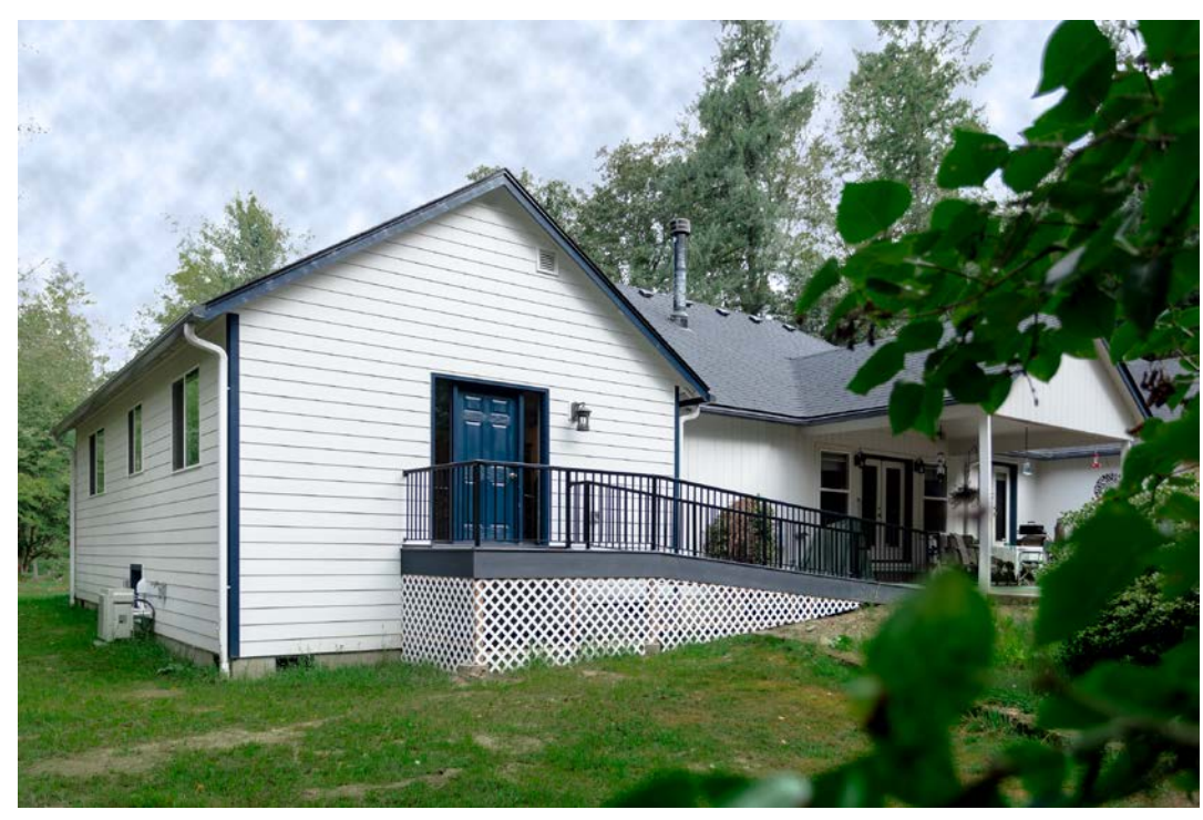
House on Remodeled Homes Tour