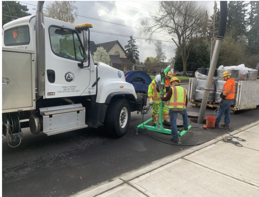
A Clark County Public Works crew replaces filter cartridges in an underground vault on Hazel Dell Avenue. Public Works' clean water division is proposing new stormwater rates to keep pace with required services.

Third and final listening session on issue set for Thursday