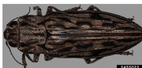
Steve Valley, ODA

Adults are 1.8-3.0cm long, have defined sculpturing on the back and may be slightly metallic. Larvae attack dead or dying Douglas-fir, true fir or pine. Various other beetle species of similar shape and pattern also occur.