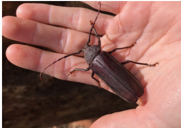
C. Buhl, ODF

Adults are 4.5-7.0cm long, brown with non-serrated antennae. Larvae attack dead and dying Douglas-fir or pine. The mandibles and boring action of these larvae inspired the 'teeth' on the modern chainsaw chain.