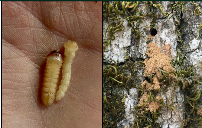
Roundhead and flathead borer larvae, respectively (left) and woodborer exit hole with whitish frass (right)