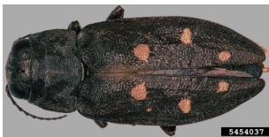
Steve Valley, ODA

Adults are 0.7-1.0cm long and have six light-colored spots. Larvae attack stressed or dying Douglas-fir, often attacking trees that are growing outside of their preferred range or exposed to drought conditions. This species