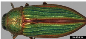
Steve Valley, ODA

Adults are approximately 2.0cm long and metallic yellow, green and red. Larvae attack dead or dying Douglas-fir or pine. Various other beetle species of similar shape and color also occur.