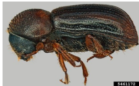
Steve Valley, ODA

Adults are often <0.5cm long and look similar to bark beetles. Ambrosia beetle larvae and adults attack dead and dying conifers or hardwoods. They create tiny holes in wood and vector fungal stains that can discolor wood - each of which may devalue some timber. See ODF Ambrosia fact sheet.