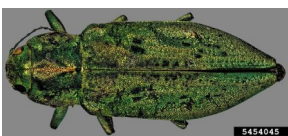
Steve Valley, ODA

Adults are 1.0-1.7cm long and bright metallic green. Larvae most frequently attack dead and dying redcedar and incense cedar but also cypress and juniper.