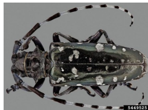
Steve Valley, ODA

Adults are 2.0-3.0cm long and shiny black with white spots. They may be confused with native banded alder borer which has bands not spots. Larvae attack many hardwood species.