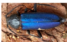
C. Buhl, ODF

Adults are 2.0-2.8cm long and metallic black and blue/violet. Larvae attack dead and dying redcedar, Port Orford and incense 'cedars'.