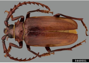
Steve Valley, ODA

Adults are 3.0-5.0cm long, brown with serrated antennae. Larvae attack various dead and dying conifers and hardwoods but may also be orchard pests.