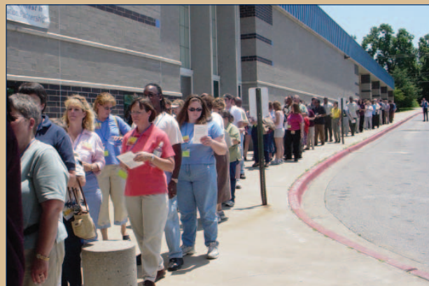
Volunteers wait in line at a dispensing exercise.

But not for you and your employees. You planned ahead, and are activating your PRIVATE Dispensing Site. Your employees know that they and their families can avoid the public dispensing sites and get their medications at work. With important paperwork already on file, the process is quick and easy. Your employees and their families are protected from harm, and your business keeps running smoothly.