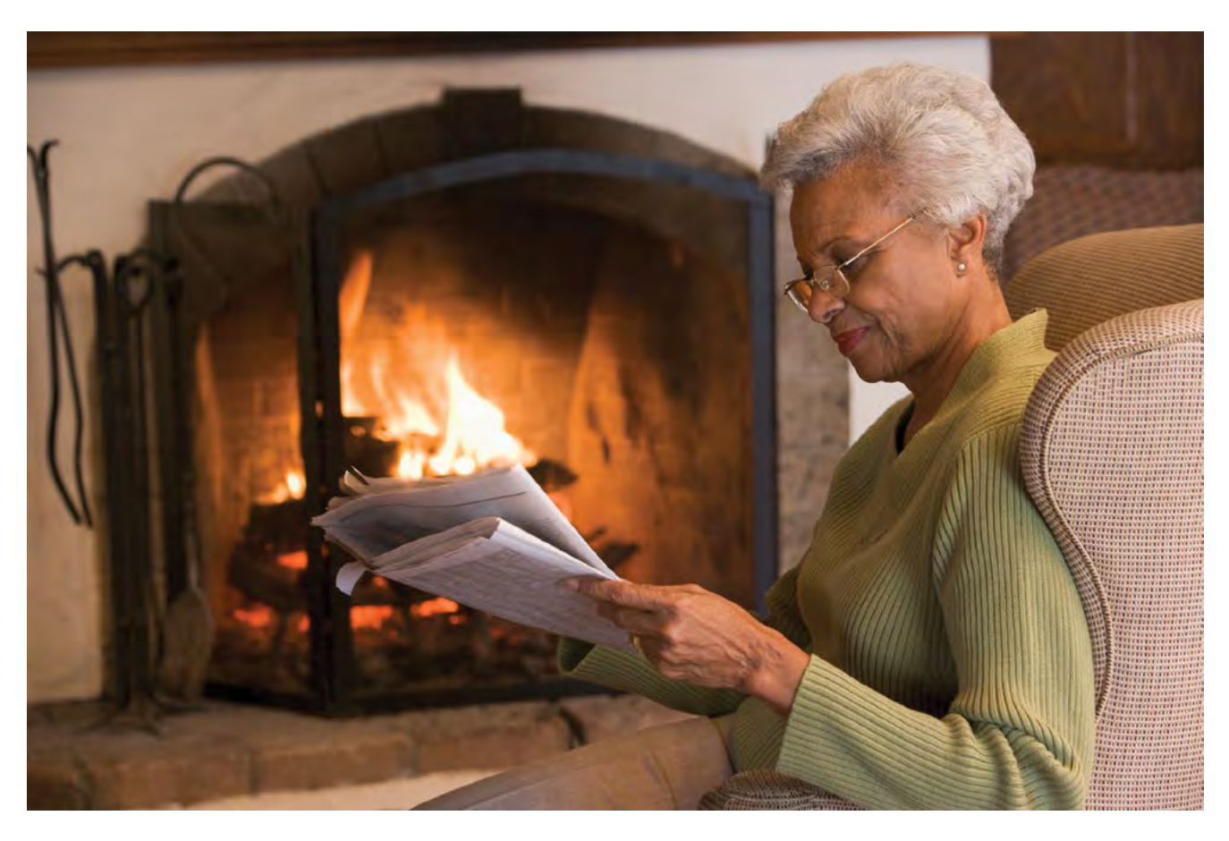
Staying Sharp—Ask the experts: Successful Aging and the Brain www.clark.wa.gov/sites/default/files/dept/files/communityplanning/aging/Support/Staying%20Sharp_Successful%20 Aging%20and%20the%20Brain.pdf

The Columbian editorial board. "In Our View: Golden Years Need Nest Egg, Vancouver seen as good place to retire, but be sure to set enough money aside." The Columbian. Nov. 2, 2017.