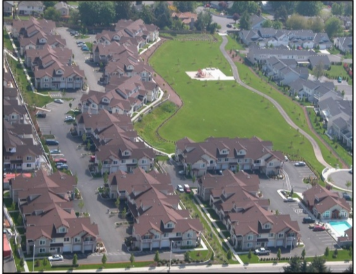
Park impact fees enable proactive planning for acquisition and development of urban parks and natural areas needed to serve growth.

State statute ( RCW 82.02 ) authorizes Washington counties and cities to collect impact fees to "ensure adequate facilities are available to serve new growth and development."