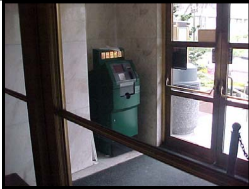
East Courthouse Entrance

All telephones used to access chambers need to be lowered to a minimum height of 48". Obstacles, such as chairs and benches must be kept clear of this area for wheelchair approach and accessibility. ANSI 308.3.1 Unobstructed – Where a clear floor space allows a parallel approach to an element and the side reach is unobstructed, the high side reach shall be 48 inches maximum and low side reach shall be 15 inches minimum above the floor.