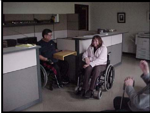
Jury Assembly Room

The reception counter in the jury assembly room exceeds height requirements for accessibility. A portion of the counter top should be lowered as detailed in the ANSI requirement below. However, as an alternate solution, a folding desk top may be considered to be attached to the side of the counter as demonstrated in the photo to the left. ANSI Service Counters – Forward Approach – A portion of the counter surface 30 inches minimum in length and 36 inches maximum in height above the floor shall be provided. ANSI Service Counters – Parallel Approach - A portion of the counter surface 36 inches minimum in length and 36 inches maximum in height above the floor shall be provided. Note: Meeting on April 17, 2007 with General Services director, Facilities Management manager and Court Administrators. Employees have been instructed to assist persons with disabilities at tables provided in jury assembly room.