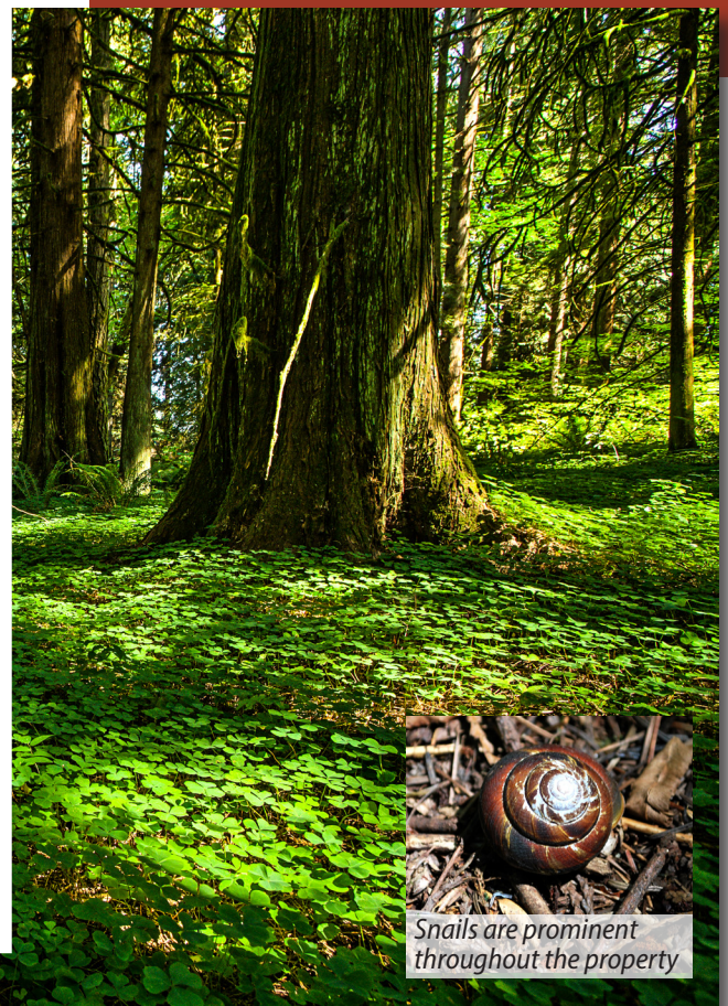
Snails are prominent throughout the property

The natural area is in the headwaters of the Salmon Creek. This 89 square mile watershed drains from east to west to Lake River and then to the Columbia. In 2010, this water quality in Morgan Creek was ranked "Fair" for quality and health.