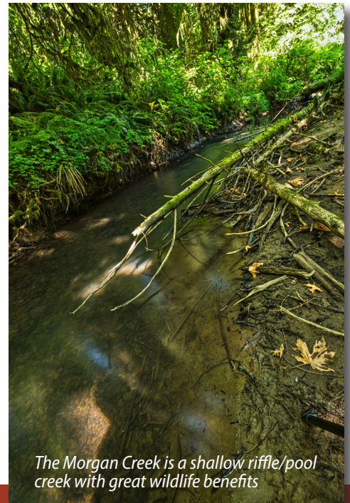
The Morgan Creek is a shallow riffle/pool creek with great wildlife benefits

Visit our website at www.clark.wa.gov/legacylands . Volunteer opportunities are available at this site. Contact the volunteer coordinator www.parkhero.org .