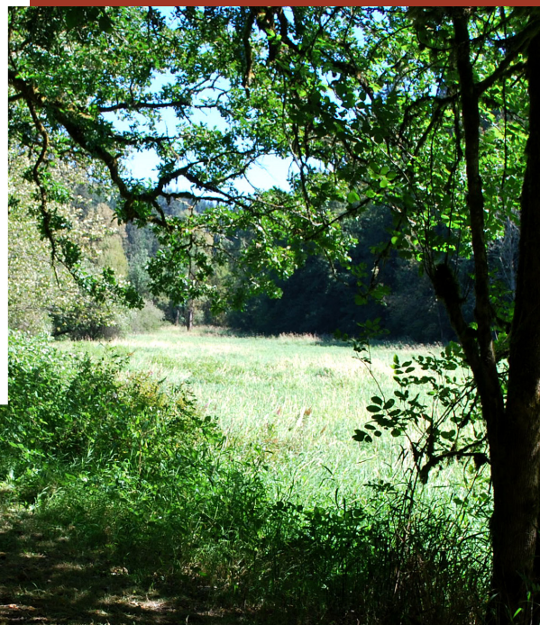
Lake Rosannah water edge trail

The natural area is located in Allen Canyon Creek subwatershed of the West Slope Watershed. The West Slope watershed contains 40 square miles in the northwest corner of Clark County. Most creeks in this watershed are in canyons. Protection of natural areas, like this one, will help with protection of the creeks, streams and lakes for years to come.