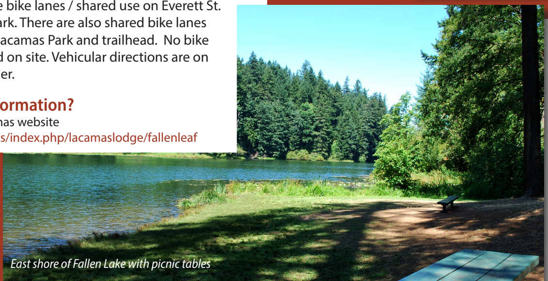
East shore of Fallen Lake with picnic tables