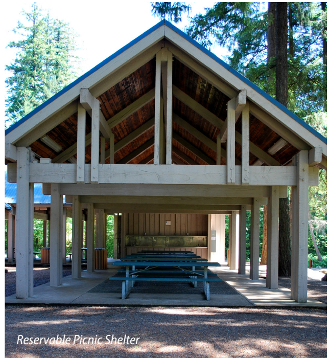
Reservable Picnic Shelter

Visit the City of Camas website www.cityofcamas.us/index.php/lacamaslodge/fallenleaf